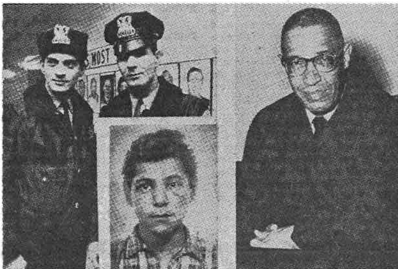
The cops, the judge and a victim who fought back.

Last week Illinois state legislators introduced a measure to bring about impeachment or a transfer of Judge Leighton.