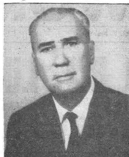
Juan Antonio Corretjer

Representatives from the Nationalist Party, the Movimiento Pro Independencia (MPI) and Movimiento Libertador also spoke. Corretjer is now National Secretary of the Liga Socialista de Puerto Rico and he called for a revolutionary