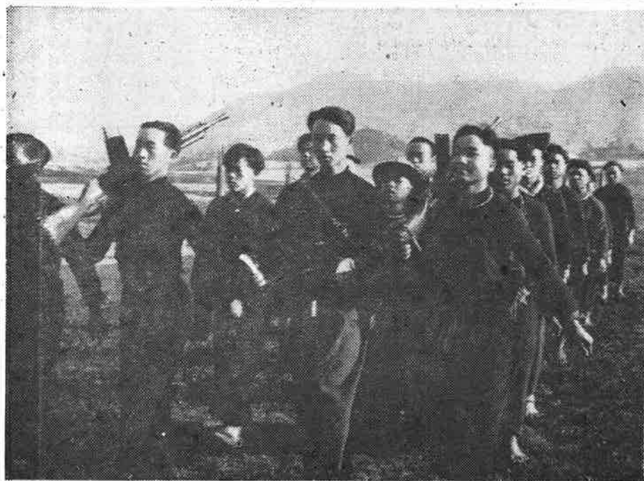
Laotian youth militia drilling to fight imperialist invaders.