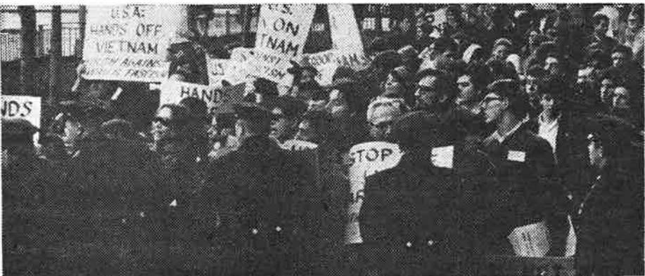
Police stopping the demonstrators between 42nd and 43rd St.

That truth would indict the U.S. capitalist system.