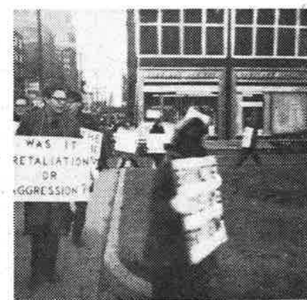
Protesting Vietnam war, Lafayette Square, Buffalo, New York

The press is trying a new tactic. The UPI and the Courier Express did not show up at all, but someone from the picket line went to their offices with a leaflet and press release. The Buffalo Evening News, which did show up for the demonstration, did not print a word