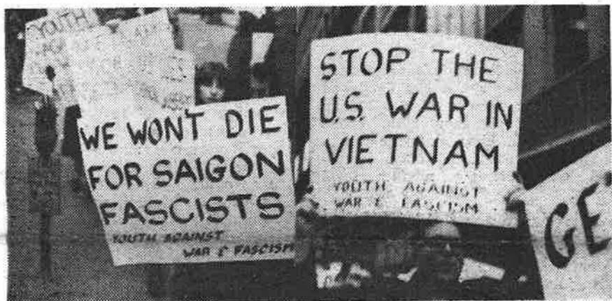
Youth protesting the reactionary U.S. war in Vietnam. Chanting, shouting, they marched from U.S. Mission at the U.N. to the U.S. Army Information Office at Fifth Avenue and 52nd Street.