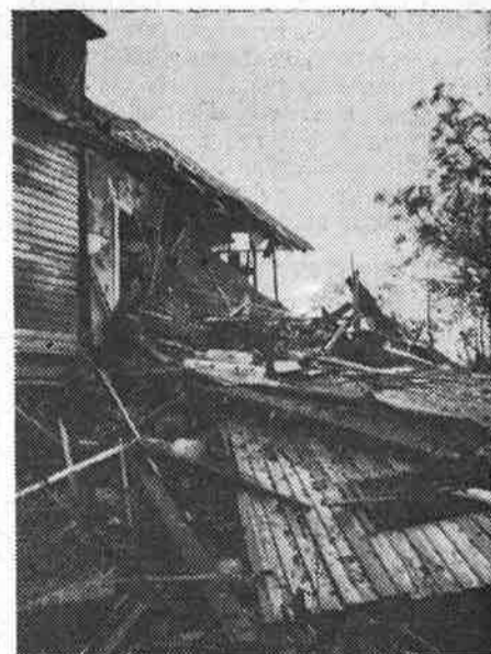
Civil rights workers' bombed-out home in Vicksburg.

Oct. 4: Vicksburg: Dynamite bomb wrecks Freedom House, destroying 8000 volume library; two of fourteen in building receive cuts.