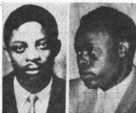
Pierre Mulele and Christophe Gbenye, Congolese Liberation leaders.