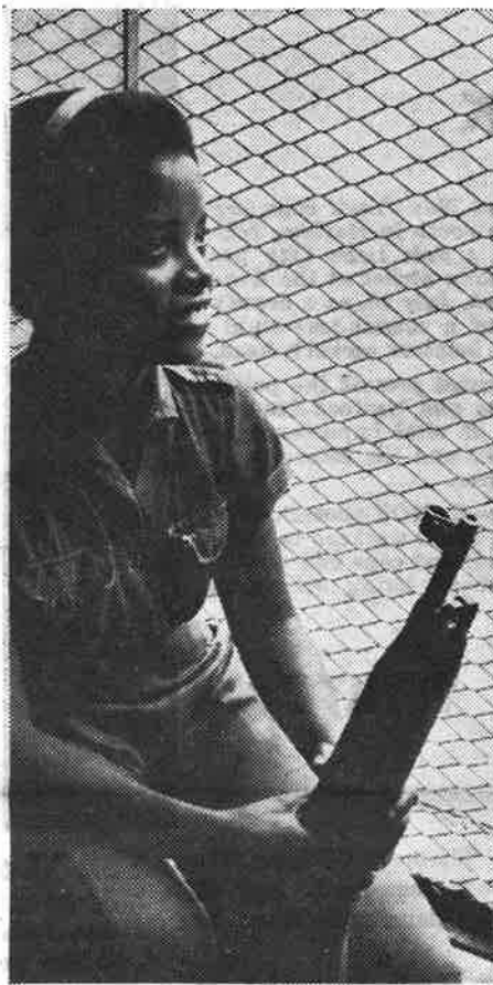
A 16-year-old Cuban "miliciana" guarding a sugar mill. Now if Harlem had police like this. . . .