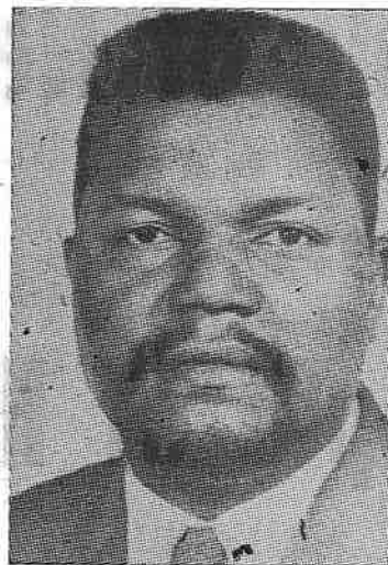
ROBERT F. WILLIAMS

Rob Williams, editor of the CRUSADER , now in Cuba, has been preaching and practicing armed self-defense for the Black People during the past seven years. Though Rob is absent, his militant ideas are ever more present in the minds of the people whom he faithfully serves.