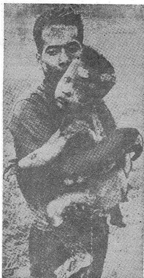
This Cambodian baby was scarred for life by U.S.-made napalm bombs. Thousands of other babies were not so lucky. They were burned to death.

The Laotian people hope that the Soviet Union, as one of the two co-chairmen of the Geneva Conference, "will refute and denounce the illegal action of Prince Souvanna Phouma in carrying out instructions from the U.S.," it said.