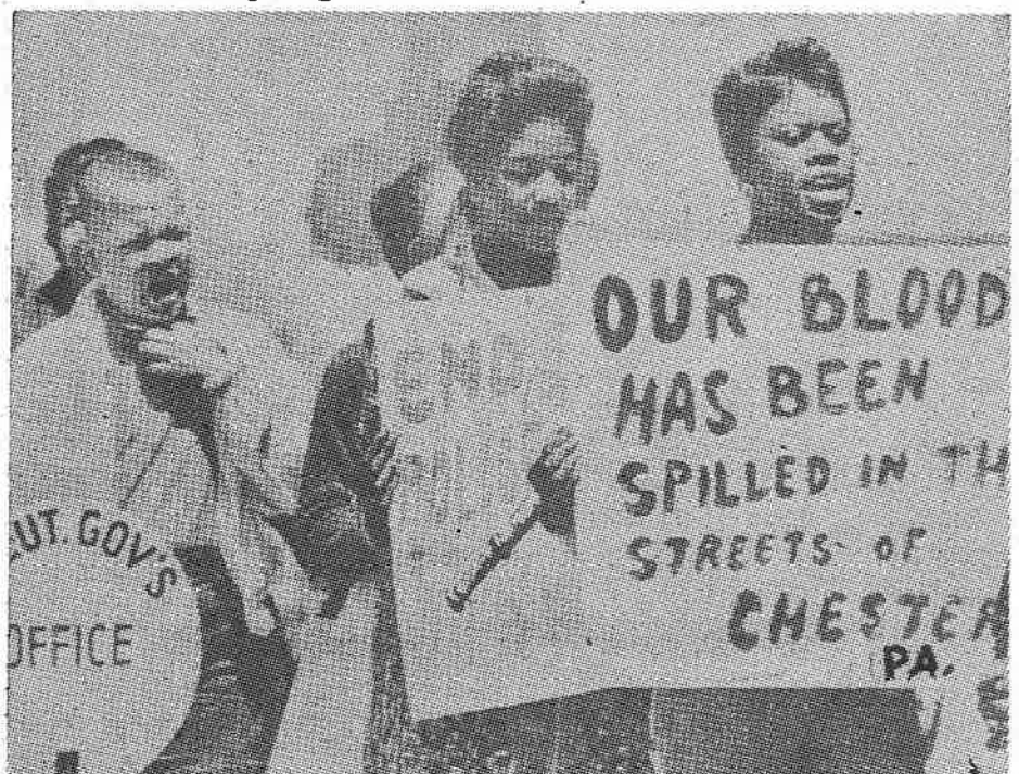
Citizens of Chester, demanding justice at State capital in Harrisburg, Pa. Last month, state police violently attacked peaceful demonstration, indiscriminately clubbed Black people, savagely beat pregnant woman.