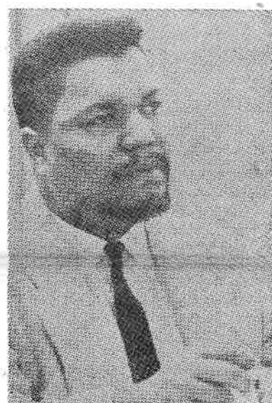
Robert F. Williams

"We must defend ourselves. We must fight back. We must reject the unwritten commitment that so-called Negro leaders have made guaranteeing our brutal oppressors immunity from retribu-