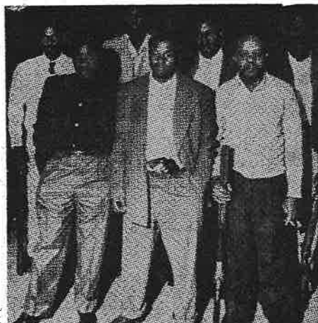
Some of the men who volunteered for Rob Williams' first armed defense guard. This was in 1957.