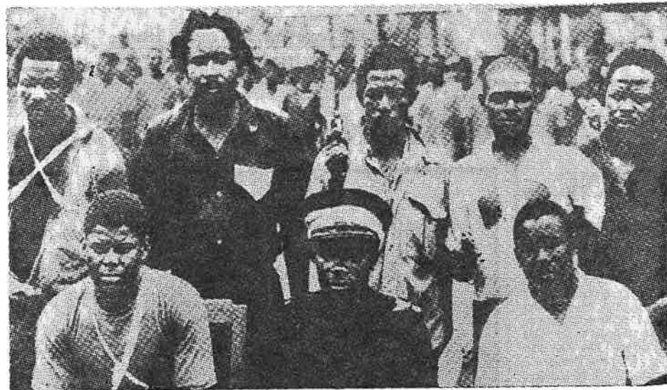
Above are some leaders of the recent revolution in Zanzibar. Seated in the center is Field Marshal John Okello. Some dispatches say there is an important faction fight in the new government and that Okello sides with the left wing.

The radio expressed the conviction that the existence of diplomatic relations between Zanzibar and China will further promote close friendship between the two peoples.