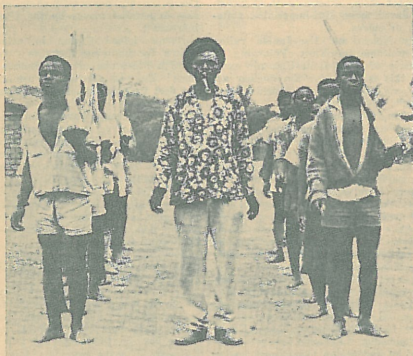
These Angolans are training with wooden guns in liberated areas. Troops of Portuguese imperialism have plenty of real guns supplied by NATO ally, the United States.