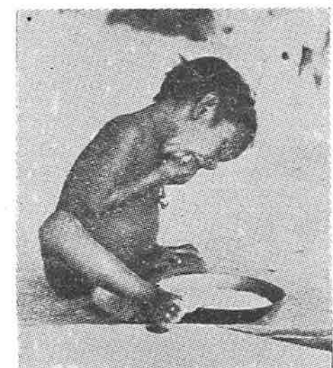
Indian baby—Belly swollen from hunger.

Since entering the White House, Jacqueline Kennedy has made news, not only by water skiing in Greece, Hyannis Port and Palm Beach, but by riding to hounds through the Virginia hunt country. She even was photographed while being thrown from a horse. There have been many photos showing her in tapered slacks she wears for sailing, golf and ice-skating. And just recently, in a blue and white bathing suit, and black skin-diving jacket, she took off from the Kennedy yacht, HoneyFitz , at Palm Beach, Fla.