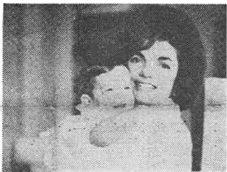
More money is spent to perfume her, than is spent to feed starving babies from Newburgh to New Orleans

(where the President, the Secretary of Defense and other dignitaries were meeting) and put on a water skiing show. Behind a fast speedboat, she put on a graceful exhibition of expert water skiing. So few people in India have so much talent, they no doubt will be very impressed.