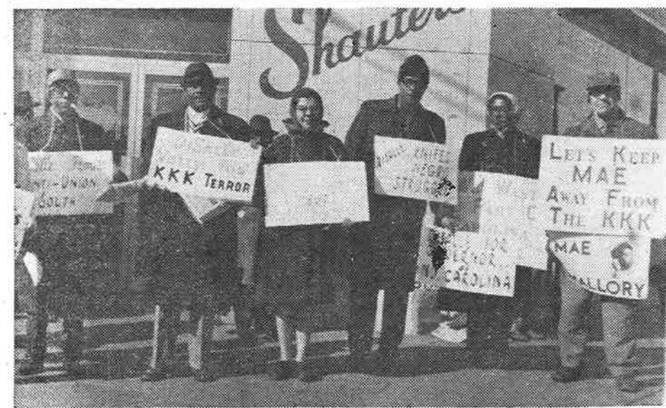
Pickets in Ohio protest Governor Di Salle's order to extradite Mae Mallory to North Carolina

Vol. 4, No. 4 FEBRUARY 23, 1962 10 CENTS