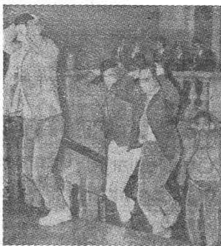
France Soir carried details of the roundup in October of thousands of Algerians in Paris.

The prisoners were herded into detention camps with horrible brutality and held in sub-human conditions for several days. Later, up to 60 bodies were found in the Seine and in the wastelands near Paris. Commissioner of Police Maurice Papon, who ordered this carried out, and his superior, Minister of Interior Roger Frey, are still in office.