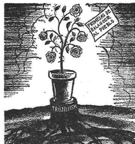
From El Mundo , Puerto Rico Caption reads: "What about the roots?" Words on sign are: "Balaguer's promises to his people."

But nevertheless it was a genuine social revolution for independence from colonialism, and as such was forced to take stern measures to preserve and protect the peoples' newly won freedom — as Cuba must also do today.