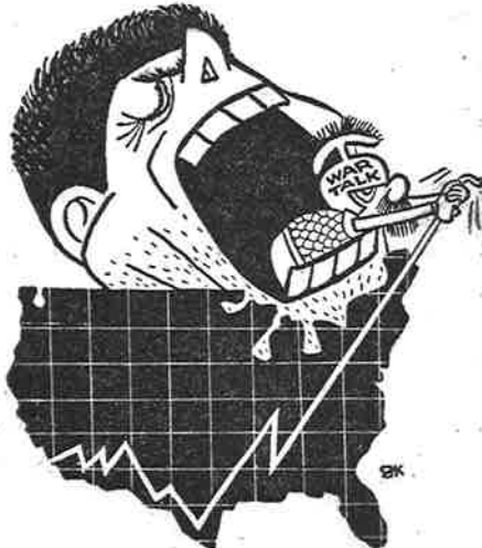
Stocks went up after Kennedy's speech.

the working stiff. And he made clear that this $2 billion rise in taxes was not to endanger the $1.2 billion cut in taxes for Big Business.