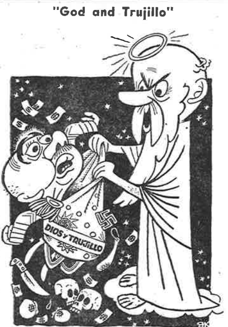
Together at Last!

This characterization of Kennedy as a servant of Wall Street imperialism was advanced by Workers World from the very first moment Kennedy declared himself to be a candidate for the Presidency. It is clear that this characterization is gaining acceptance with some of the more class-conscious segments of the labor movement.