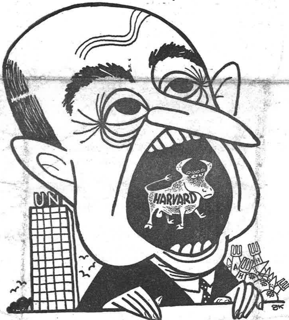
—A Lot of Harvard Bull