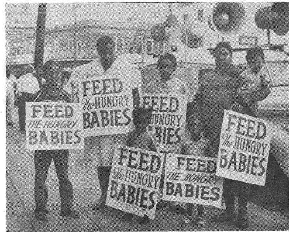
—But Can't Find Any Money to Feed Hungry Children! (These mothers and their children were demonstrating for help from racist relief authorities in New Orleans)