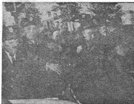
Cops beat up a GE striker, left, at Lynn, Mass., and right, they escort a scab into work.