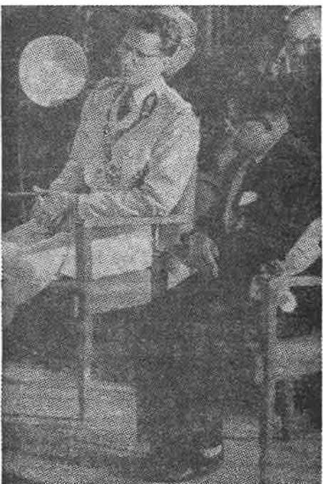
The Belgian King and the Congo President are shown here on the ceremonies of June 30, the Congo's "Independence Day." Note the higher seat arranged for the Belgian King—an eloquent symbol of the actual situation.