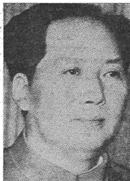
Mao Tse Tung