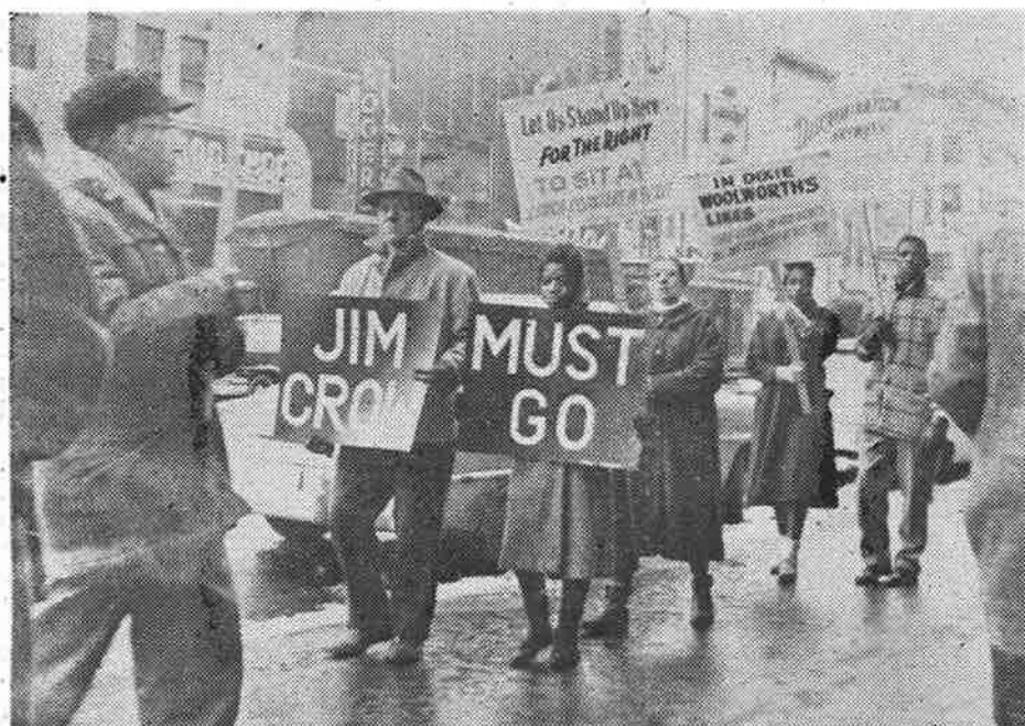
The NAACP and Local 1330 of the United Steelworkers joined to make this picket line a success.