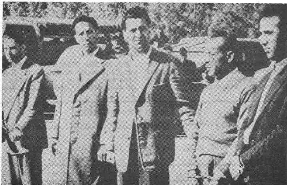
Victims of French imperialist treachery: the five Algerian leaders who were kidnapped by a French plane while en route to a peace conference in Tunis. Note the handcuffs.