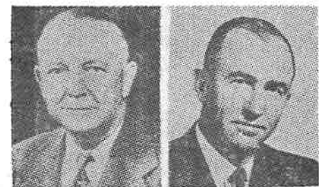
Dan Kimball Ex-Sec'y of Navy Now OWNER of Aerojet-General Co. Frank Pace Ex-Sec'y Army Now President of General Dynamics

This is not because of the fat retirement pay of these high officers and the short enlistment necessary to get it be-