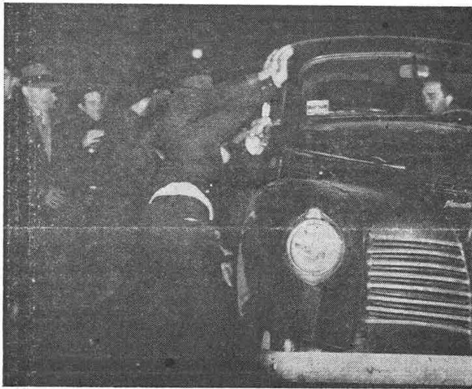
Bethlehem, Pa. — Steelworkers during the 1937 Little Steel Strike, overturning car, in militant struggle.