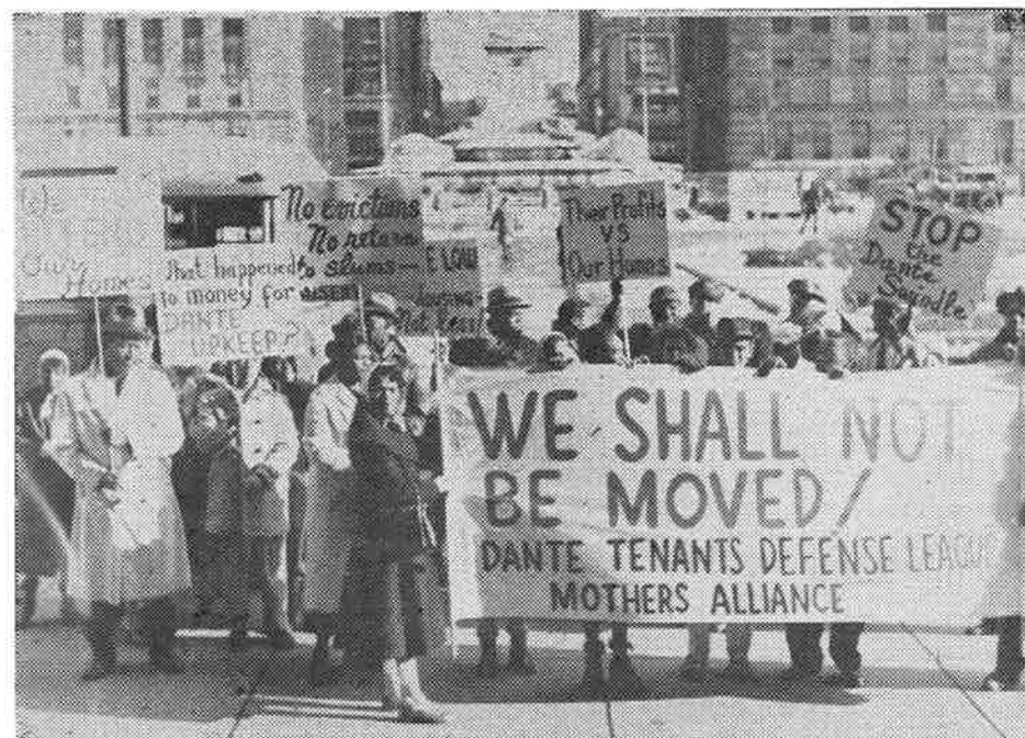
Buffalo, December 12 — The sign-holders pictured above are part of a group of tenants of a housing project who stormed the chambers of the Buffalo Common Council in protest against a plan to drive out 616 families and convert the Dante Project into a privately-owned, high-cost housing development.