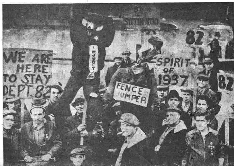
Detroit, Michigan — These workers are enthusiastically joining the great "sitdown" movement that swept the country in 1937.