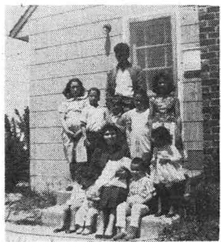
The Rivera Family

Last week you were able to go back to work again. After 2 days on the new job, the constable came around with that paper. It was the final notice. You had to get out. How? What is a man with 10 kids going to do? Where can he go? It was now Saturday; you couldn't reach the welfare office and time was growing short.