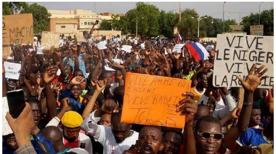
Thousands of Nigeriens demand the withdrawal of French and other foreign troops in Niamey, Niger, Aug. 3.

Demonstrations in Niger and elsewhere support the new government, along with targeting the French Embassy, a symbol of brutal French colonialism and exploitation of Nigerien people. (Nigerien refers to the people of Niger; Nigerian refers to the people of Nigeria, formerly a colony of Britain.)