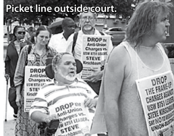
Picket line outside court.