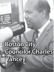
Boston City Councilor Charles Yancey.