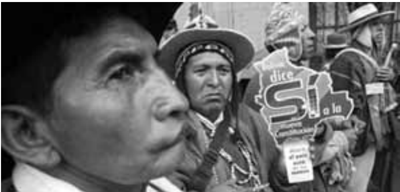
Some of the thousands who mobilized in La Paz Dec. 5. The banner says “The Guaraní Nation supports the new Constitution. Long live Indigenous autonomy.”

“Bolivia is a nation among nations,” Morales said, referring to the diversity of Indigenous peoples whose traditions date back centuries. “We are not a country of blue-eyed, green-eyed folks only. It’s a pluri-national country made up of dark-skinned and white-skinned. This new Constitution will unite us.” (CNN, Dec. 12)