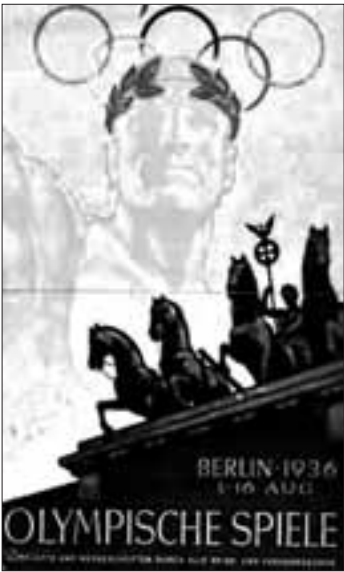
Drug profits fueled performances at the 1936 Nazi Olympics.

followed by construction workers at more than 15 percent. In terms of age groups, younger workers between the ages of 18 and 25 proved to be the most prevalent users of drugs. There are more "illegal" drug abusers who are employed than unemployed and more workers with a decent income who use these drugs compared to those with a low income. Contrary to these facts, there are more people in prison on misdemeanor drug convictions, a disproportionate number of them Black, Latin@ and Native. In a separate HHS survey on the impact of abuse of alcohol—a legal drug—more than 10 million workers, or 8.8 percent, admitted to excessive alcohol drinking within the same one month period. This growing trend of drug and alcohol abuse is occurring at a time when there is less drug treatment, including preventive programs, and more random drug testing by the bosses. Close to 49 percent of full-time workers in this survey said that their employers conducted testing for drug use. For those who test positive, they are much more likely to face being fired than getting some kind of treatment. Drug use a result of capitalism What all of these facts and figures fail to explain is that the fundamental cause of this social epidemic lies in the capitalist system—that is, the drive to make more and more profits through fierce competition. As massive layoffs deepen, the downward spiral in workers' wages and ben-