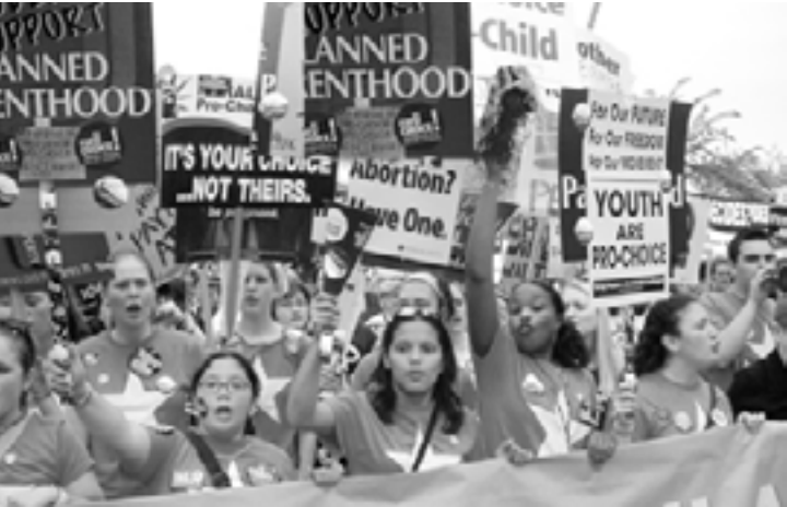
Washington, DC April 25 ,2004

African American Women Evolving, a reproductive rights organization which is part of the campaign, states that “Black women are three times as likely as white women to have an abortion and also represent a large percentage of women living under the poverty line. They must use already limited resources that would otherwise be used for basic living necessities to obtain an abortion. ... Denying ACCESS