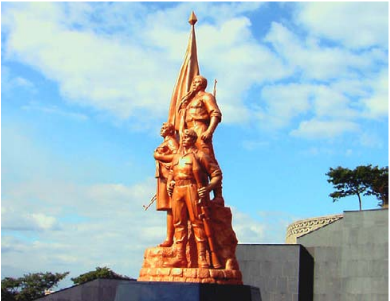
Heroes Acre in Harare, Zimbabwe.