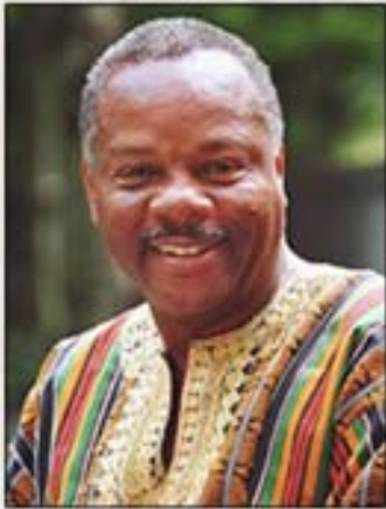
Keynote Speaker Dr. Molefi Asante Professor, Author Esteemed International Pan-Africanist

"The best way of learning to be an independent sovereign state is to be an independent sovereign state."