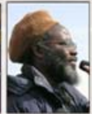
Chaka Cousins All African Peoples Revolutionary Party