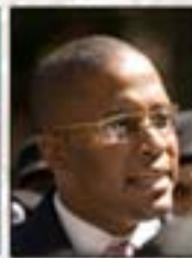
Atty Malik Zulu Shabazz New Black Panther Party