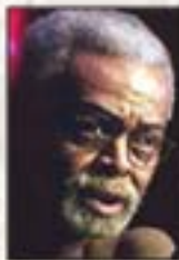
Amiri Baraka Unit & Struggle Newspaper