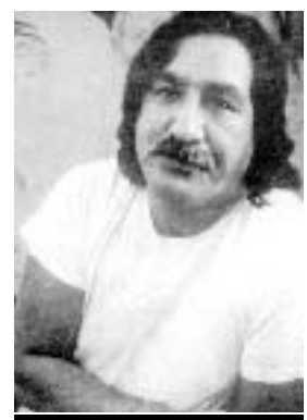
Free Leonard Peltier!

To read the NAACP resolution, visit iacenter.org or millions4mumia.org. □