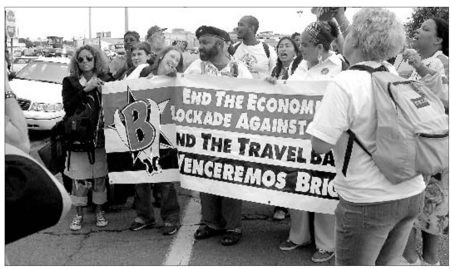
Crossing the Peace Bridge into Buffalo, N.Y., from Canada on July 19.

When the delegations were due to return home, activists from all over the U.S. drove hours and flew in from great