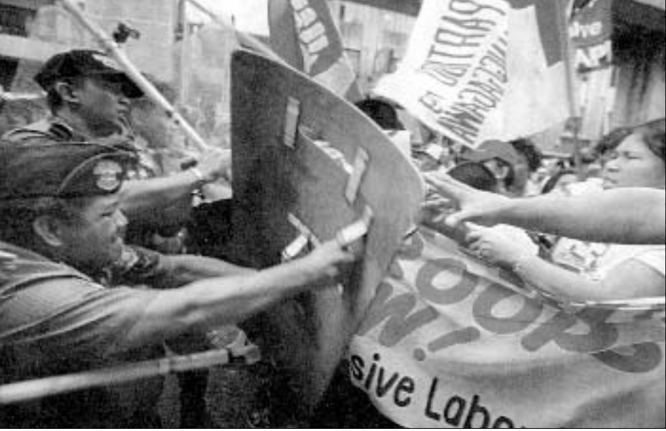
Growing wave of resistance swept Philippines.

The Saudi Arabia chapter of Migrante International sent a petition to the Philip-