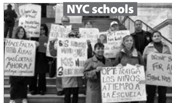
PIST members rally Oct. 19.

A letter signed by dozens of parents and supporters was taken to the Schools Chancellor. It denounced the fact that the Office of Pupil Transportation laid off several hundred qualified drivers and escorts at the start of this school year, and then reshuffled the children onto routes that