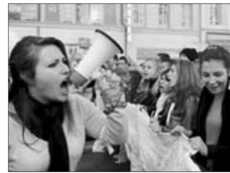
Marseilles high school students, Oct. 16.