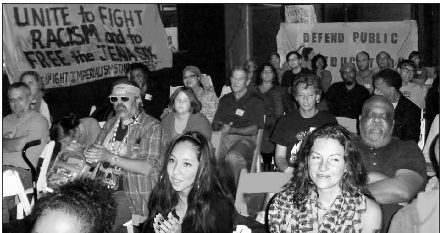
Audience listens to plenary talks during Oct. 23 socialism conference in Durham, N.C. Read article on pages 6-7.