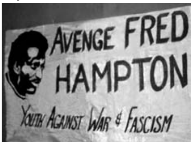
Honoring 'Chairman Fred,' martyred Black Panther leader.