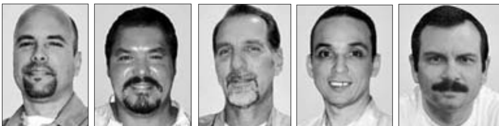
Gerardo Hernández Nordelo, Ramón Labañino Salazar, Rene González Schwerert, Antonio Guerrero Rodríguez & Fernando González Llort.