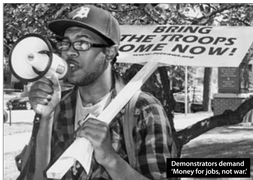
Demonstrators demand 'Money for jobs, not war.'