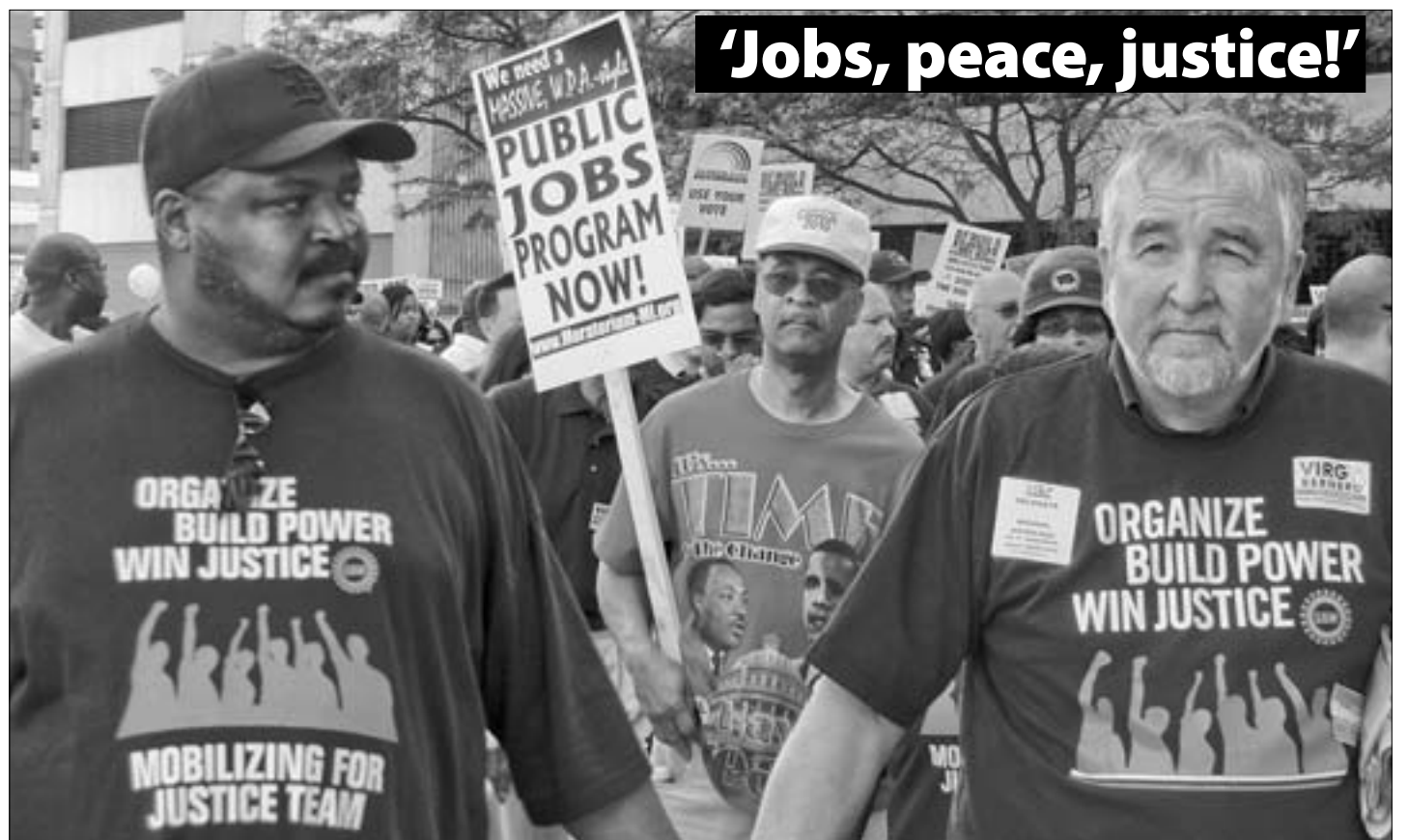
Unions, community march in Detroit, Aug. 28. See page 5.