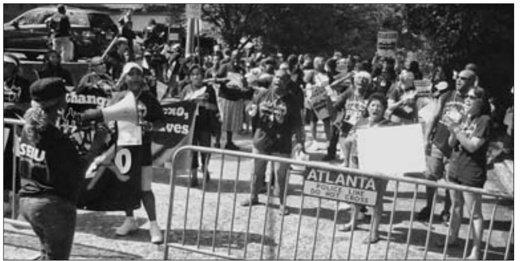
Rally supports Sodexo workers.

Participants reunited at Mount Moriah Baptist Church for a town hall meeting