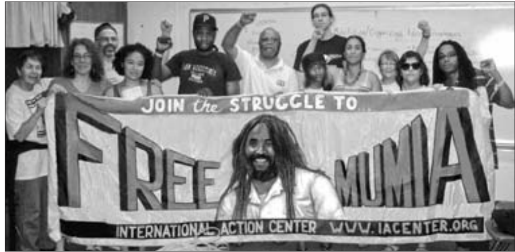
Mumia Abu-Jamal supporters in Detroit.

More than 2,500 copies of Workers World newspaper were sold or distributed during the five-day event, and dozens of trial subscriptions were sold. A front-page article by Abayomi Azikiwe about the crisis in Detroit, with the main headline "Abolish Racism, Capitalism," and a WWP statement "Fight for Socialism" made the issue especially attractive to USSF participants. Activists also distributed 1,600 copies and sold subscriptions