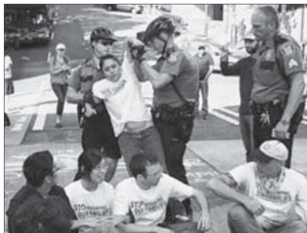
Seattle, June 23.