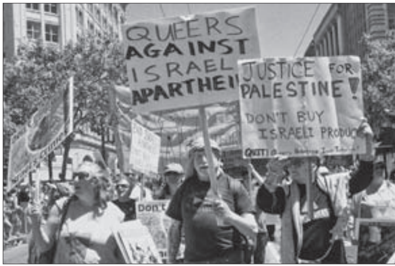
Above, San Francisco; Below, NYC, June 25.