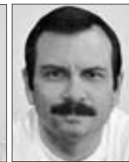
Gerardo Hernández Nordelo, Ramón Labañino Salazar, René González Sehwerert, Antonio Guerrero Rodríguez and Fernando González Llorca. For more information: www.thecuban5.org