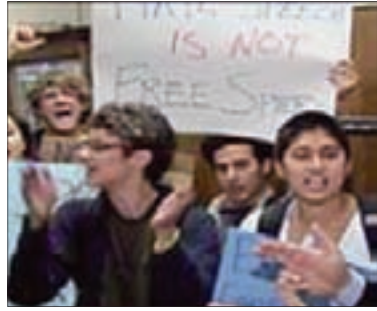
'Hate speech is not free speech,' 'solidarity with all immigrants' was the protesters' message.

The response to the protest by the corporate media and university administrators has been libelous and one-sided. The Raleigh News and Observer published an editorial in which it condemned the students for "silencing" Tancredo and violating his "right" to free speech, comparing