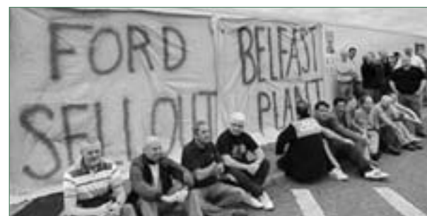
Workers at the Visteon factory sit in to save 210 jobs.

occupying the plant in the Occupied North now for almost a month. They are demanding the full severance—"redundancy"—payments that they were entitled to under the Ford contract.