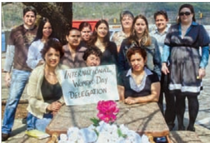
Delegation visits immigrant women detainees in Alabama on International Women's Day, March 8.

For more information, go to www.gadetentionwatch.org . □