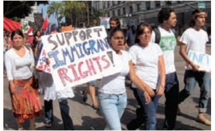
San Diego, May 1, 2008.

Según los/as organizadores/as de la conferencia, el enfoque del evento era desarrollar un plan de acción para construir un movimiento para la movilización y organización más allá del sur de California. Esta red se centralizaría en torno a tres principios básicos de unidad y trabajaría para continuar la resistencia y organización en nuestras comunidades contra el terror de la Migra que está respaldada tanto por el partido Demócrata como el Republicano. □