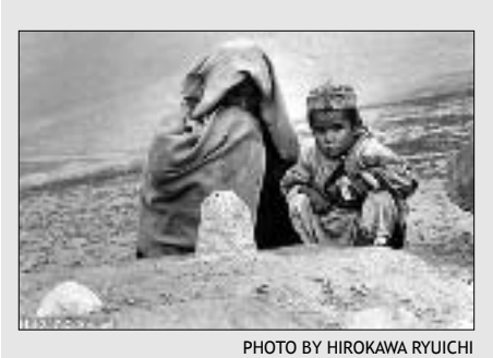
War censorship: What you don't know can hurt them